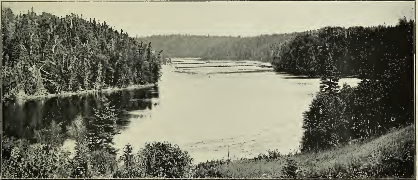
MIRA RIVER ON THE ROAD TO LOUISBURG, C.B.

Prince Edward Island draws thousands of people to its shores during the summer months, for its coolness and bathing. It is a beautiful spot, with its rich, red soil, and its vivid green grasses and woods. In the richness of the colors of its landscapes, and the remarkable clearness of its atmosphere it is almost tropical, and the visitor gets much the same impression on approaching its shores as he does when cruising among the West Indies.